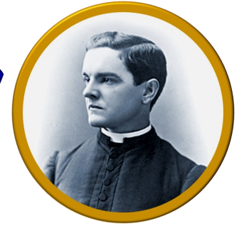
Venerable Fr. Michael McGivney