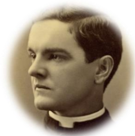
Blessed Fr. Michael McGivney